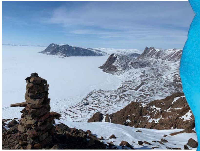
▲ View of Grise Fiord from the mountains.